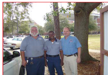
Adsil receives glowing testimonial from Gator maintenance staff!