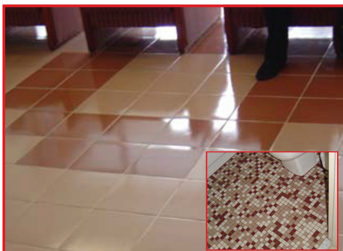
After treatment with MicroGuard®

UF has used MicroGuard® clear floor treatments since 2001 on over 250,000 square feet of bathroom & commons area tile floors and over 60,000 square feet of concrete flooring in the student union area. They continue to extend this work as time and budget permits. According to Jim Crocker, Assistant Director of Housing, MicroGuard® treatments have provided the following benefits: